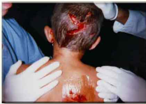
A young boy after a dog attack.

A study by Beck done in 1975 indicated that 87% of biting dogs are intact males and most dogs bites occur in or near the victim's home. Another study by Sacks in 1989 indicated that 70% of the children that were killed by dogs were under the age of 10 and 22 % were under the age of one year with 7% being sleeping infants.